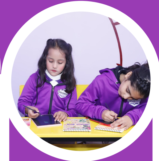
Developmentally appropriate curriculum